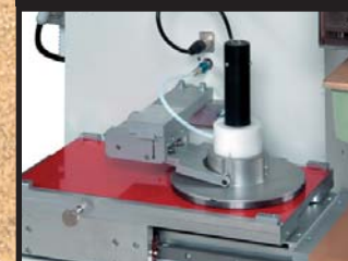
Closed cup system