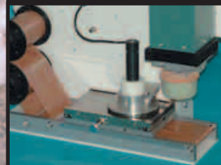
Viscomatic ink control